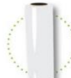
Pallet wrap & stretch film