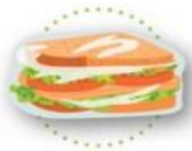
Ziploc & other reclosable food storage bags