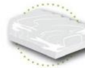
Wood pellet bags