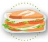
Ziploc & other reclosable food storage bags