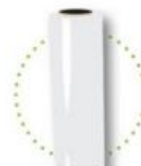
Pallet wrap & stretch film