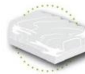
Wood pellet bags